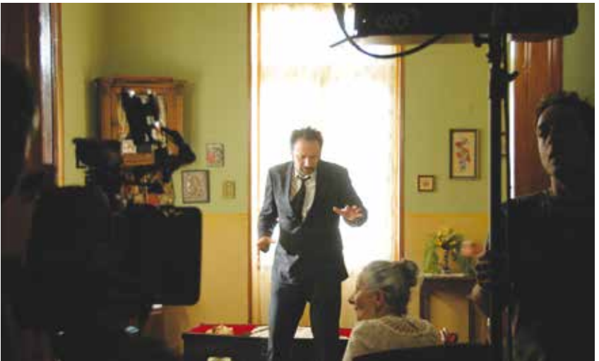
“mother of pearl and coral” by C. P. CAVAFY